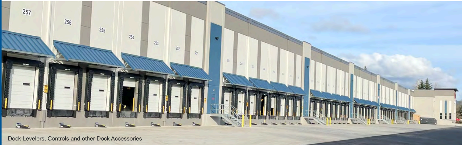
Dock Levelers, Controls and other Dock Accessories